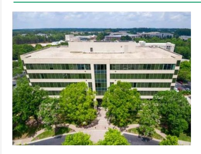
Oconee State Bank - Gwinnett Financial Center 2055 Sugarloaf Circle Suite 50 Duluth, GA 30097

We've Moved! Team OSB is beyond excited to welcome customers to our beautiful new space in Gwinnett. This move provides numerous opportunities to better serve our existing client base and our local community as a whole.